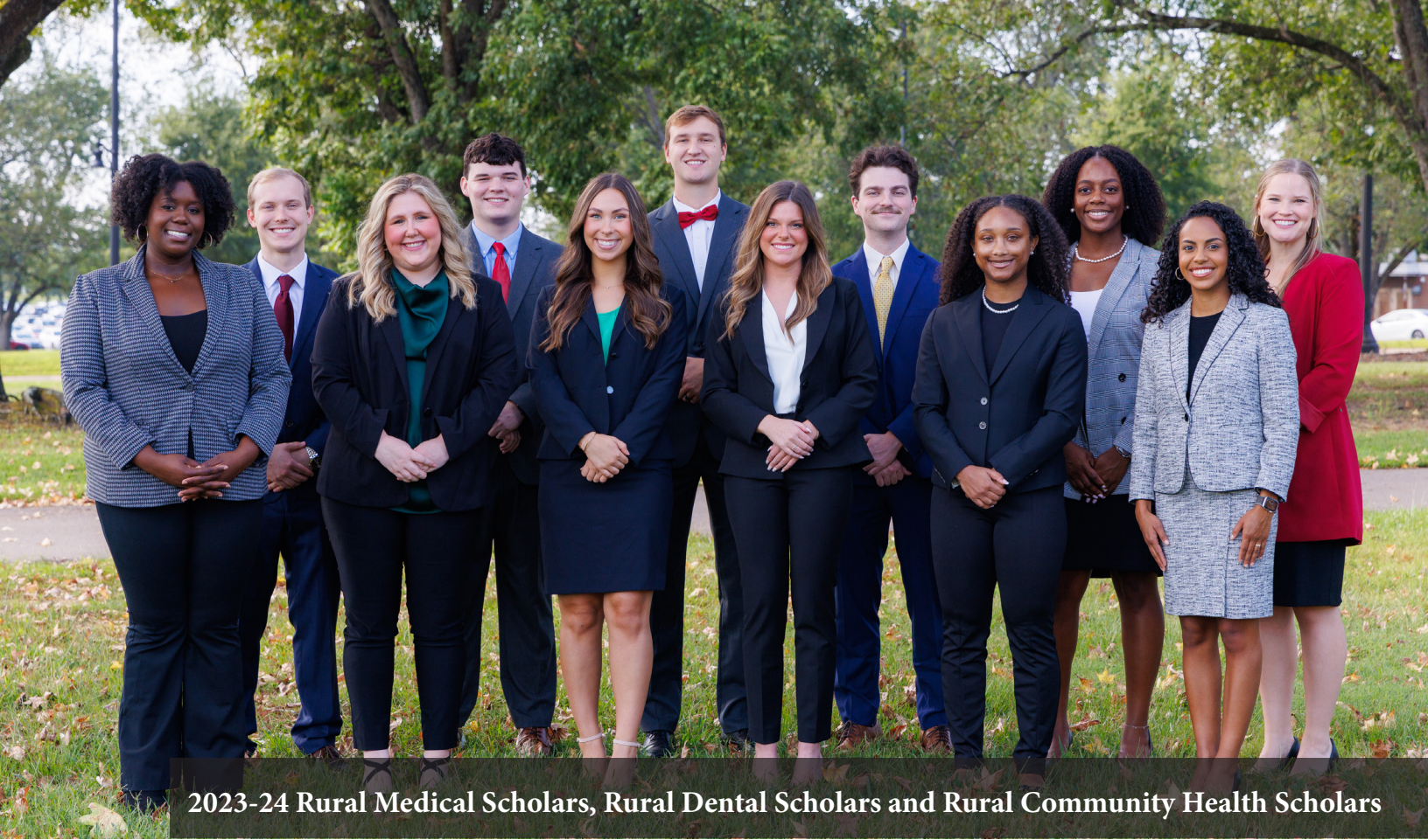
2023-24 Rural Medical Scholars, Rural Dental Scholars and Rural Community Health Scholars